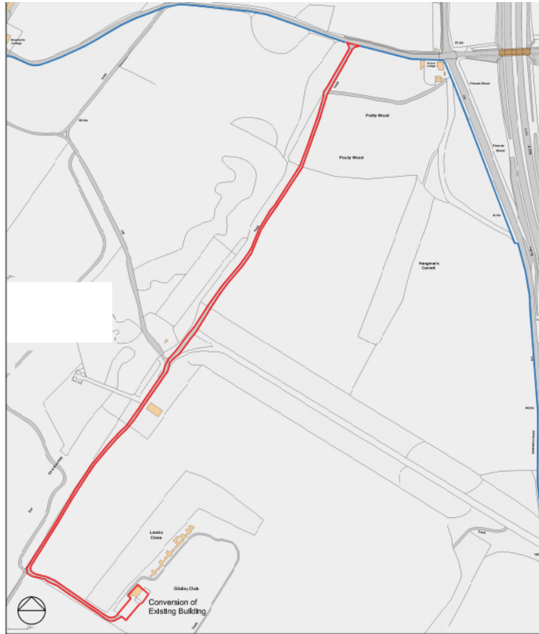
Figure 1: Existing site location