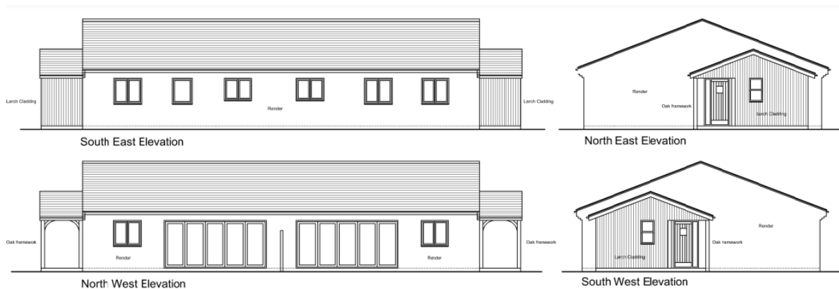
Figure 3: Proposed elevations