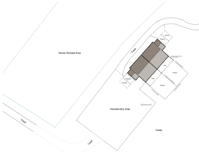
Figure 2: Proposed site