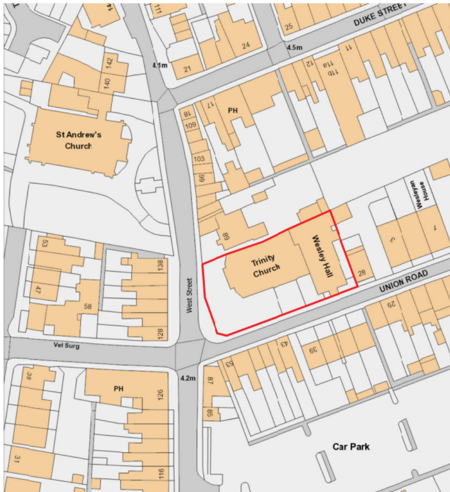
Figure 1 – Site location plan

1.1 The application site comprises a car park which serves the Trinity Methodist Church, which lies within the urban boundary of Deal. The site and surrounding area are flat and Union Road is a one-way street with no on-road parking. There are pavements on either side of the street. The street comprises of a mixture of terraced houses and a detached house as well as another car park at the other end of the street. The main access to the site is located on West Street.