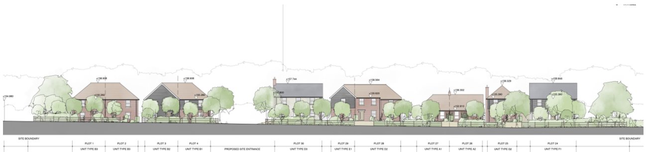
Figure 2 – Capel Street Street scene

2.12 The proposal includes predominantly two storey and 2 single storey detached and semi-detached dwellings of varied sizes, forms, designs and material finishes. The height of the Capel Street frontage units has been amended and reduced to ensure these units do not exceed the height of the adjacent neighbours, either side of Capel Street, 107 and 127 respectively. No dwellings exceed two storeys and there is no provision of accommodation within the roof space. The design and material finish of some units has been amended during the application to provide greater visual interest and detailing to particular units and provide appropriate materials in relation to their position. The proposed dwellings comprise moderate, varied footprints and are of a range of built forms, with the most predominant roof form comprising hipped roofs or side gabled roofs, which hip away from the adjacent properties.