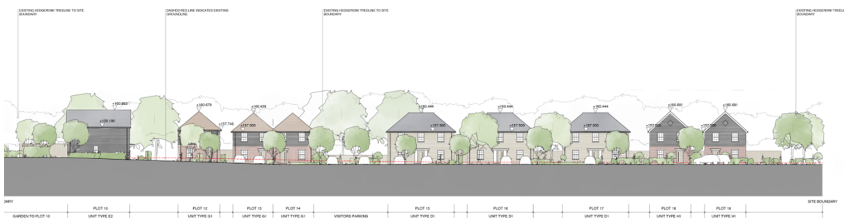
Figure 3 – Internal Street scene

2.13 The scale, height, form and moderate footprints of the proposed dwellings are considered to be compatible with the surrounding built environment, which contains dwellings of varied, comparable scales, heights, forms and footprints. The proposed Capel Street frontage includes a variety of unit types and designs including 2 single storey semi-detached bungalow units. Bungalows are prevalent in the immediate vicinity, including opposite the site, and the inclusion of 2 bungalow units is respectful of the existing character and aids the integration of the development into its context. These street frontage units are considered to reflect the varied dwellings in the locality, of appropriate, proportionate scales and heights, and will be comfortably accommodated in the street scene. This includes sufficient separation distance between units and to the adjacent neighbouring properties. The general scale and height of units across the scheme is reflective of the street frontage and relative to the ground level changes on site. This provides consistency across the scheme and comfortably accommodates the development within the site.