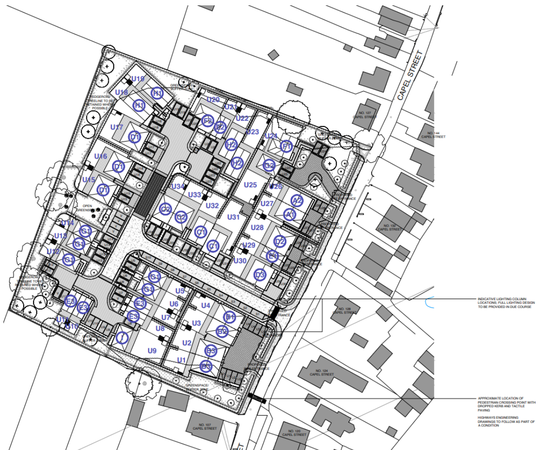
Figure 1 – Layout Plan