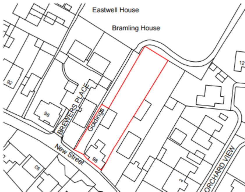
Figure 1: Site location plan